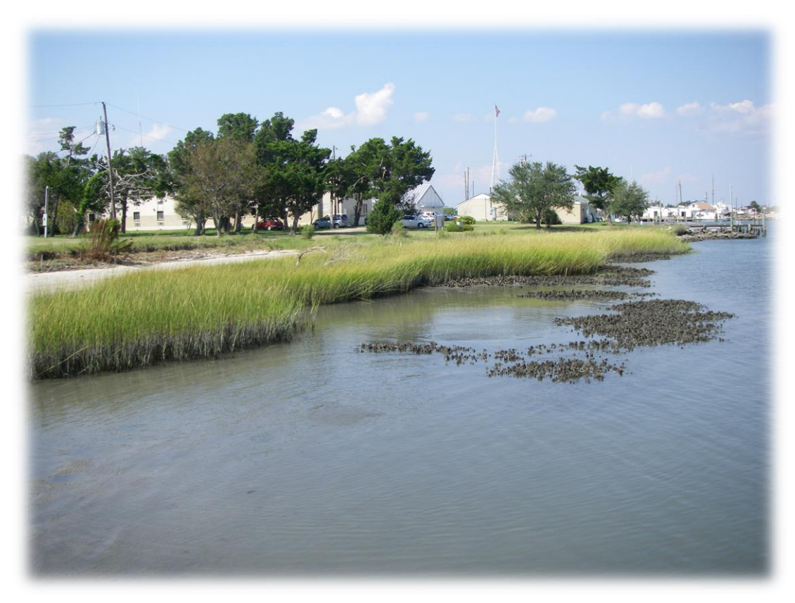
NOAA Lab, Beaufort, NC

NOAA's engagement in living shoreline approaches to shoreline stabilization is influenced by several of our coastal habitat and natural marine resource mandates and authorities, which are described in the Appendix.