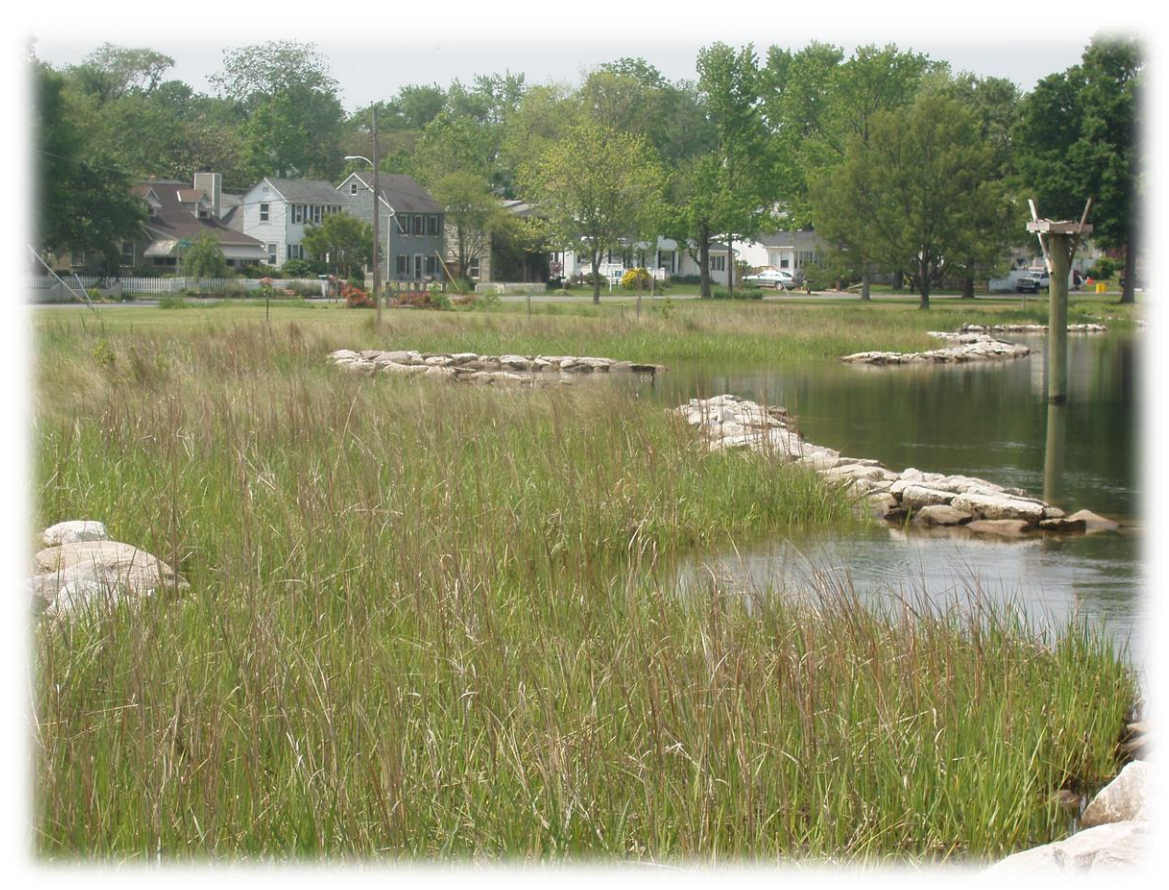
Londontowne, MD

Living shorelines are an important tool for managing coastal erosion, enhancing intertidal habitat for fish and marine resources, and enhancing the resilience of coastal communities and ecosystems against sea level rise, climate changes, and extreme climate events. When used at appropriate sites, living shorelines allow for continued coastal processes and ecosystem connections while also providing shoreline stabilization. As such, NOAA encourages the use of living shorelines as a shoreline stabilization technique along sheltered coasts to preserve and improve habitats and their ecosystem services at the land—water interface. NOAA recognizes that there are a variety of green and living shoreline options that can be implemented to preserve coastal habitats and build coastal resilience and participates in partnerships to identify and clarify those options. Through our many roles—from building and nurturing partners, to delivering science-based information and leading by example—NOAA continues to promote living shorelines for shoreline stabilization, habitat connectivity, and community resilience.