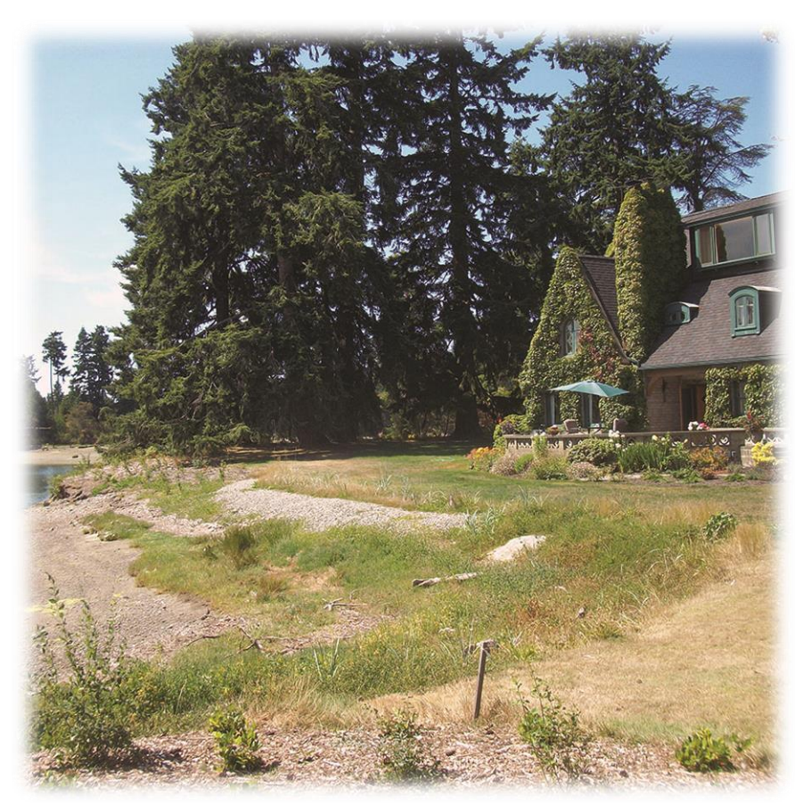
Bainbridge Island, WA

habitat tradeoffs. For many types of shoreline protection (including living shorelines), negative impacts can result on existing shoreline and nearshore habitats and the coastal species that depend on those habitats by replacing soft or living material with hardening materials (e.g., by replacing subtidal mudflats with rock sills). Living shoreline methodologies that avoid or minimize channel-ward encroachment into subtidal areas minimize these trade-offs. Minimizing the footprint of hard, unnatural structures reduces the effects on the infaunal community (Bilkovic and Mitchell 2013). While the vegetation and fish utilization in constructed marsh sills can mirror that of nearby natural marshes in just a few growing seasons, (Currin et al. 2008, Gittman et al. 2015b), epifauna (i.e. oysters and mussels) and infaunal species density takes longer to catch up to a natural state (Bilkovic and Mitchell 2013).