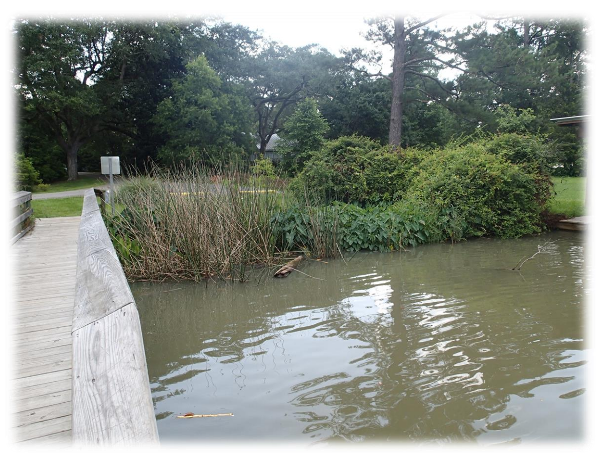
Magnolia Springs, AL

• Training, Technical Assistance, and Policy: NERRS, the National Coastal Zone Management Program, and the Sea Grant College Program can provide direct technical assistance and develop guidance and manuals to support the implementation of living shorelines at a regional level. These programs also provide trainings and public webinars to educate others about living shoreline implementation and monitoring. Through the National Coastal Zone Management Program, NOAA works with state coastal management programs to support the revision of state policies and regulatory processes to encourage and facilitate the use of living shorelines. On a project-specific basis, staff from NMFS and the Restoration Center provide technical advice and guidance on project design and permitting.