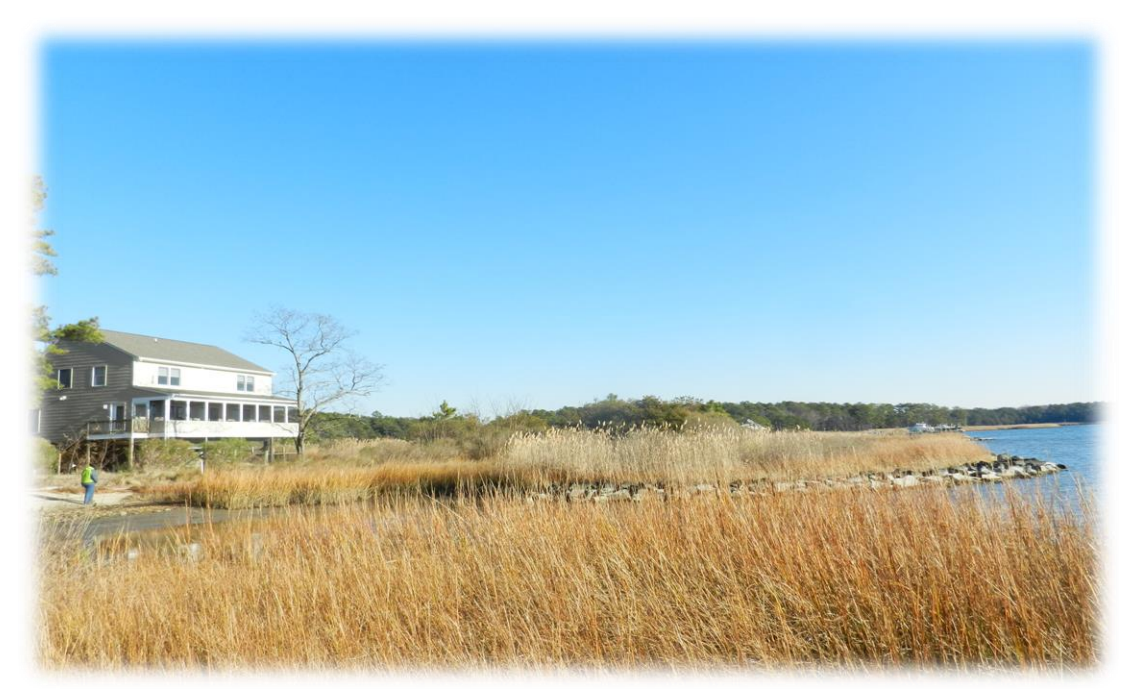
Chesapeake Bay Environmental Center, MD

This guidance focuses on shorelines along estuarine coasts<sup>1</sup>, bays, and tributaries rather than non-sheltered coasts, like shorelines facing open ocean. Maintaining natural habitats that provide shoreline erosion protection even outside of sheltered coasts (e.g, coral reefs, oyster reefs, mangroves, seagrass beds, and marshes) is favorable wherever feasible. This is not a siting or design manual and does not provide instructions for living shoreline implementation in specific locations.