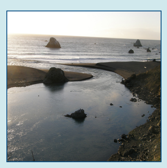
The mouth of the Russian River Estuary.