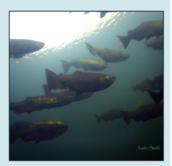
Russian River Chinook salmon.

Bodega Marine Laboratory U.S. Geological Survey Univ. of CA Cooperative Ag. Extension Gold Ridge Resource Conserv. District CA Dept. of Fish & Wildlife Sonoma and Mendocino Farm Bureaus