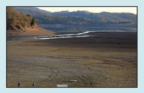
Lake Mendocino during the 2013 drought.