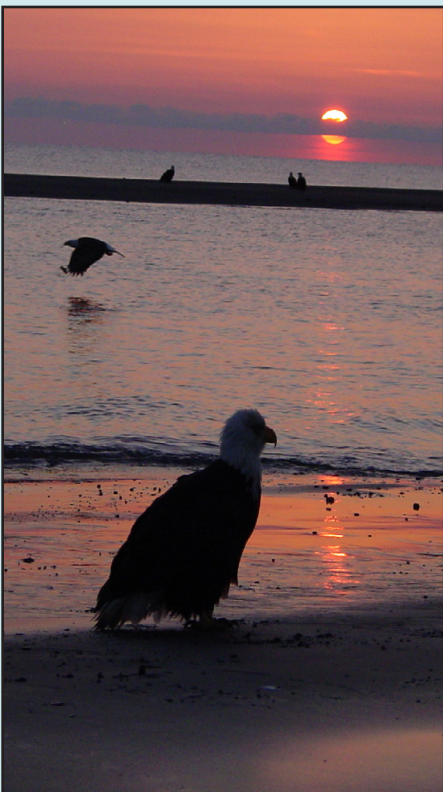
An eagle at sunset on Kachemak Bay.