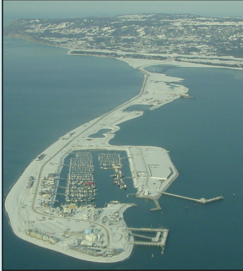
Kachemak Bay, Alaska