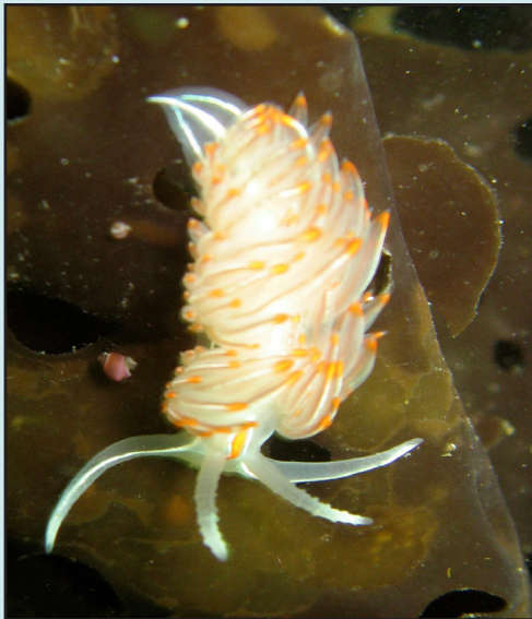
Opalescent Nudibranch