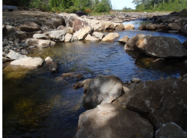
East Branch Lake Fishway

replaced with nature-like fishways constructed of natural materials (rock), restoring passage for sea-run fish including alewife, American eel and Atlantic salmon (a NOAA "Species in the Spotlight"). The benefits to alewife are expected to be substantial due to the large amount of spawning habitat in South Branch Lake (2,035 acres) and East Branch Lake (1,100 acres). At South Branch Lake, outmigrating juvenile alewife have already been seen leaving the lake through the restored channel.