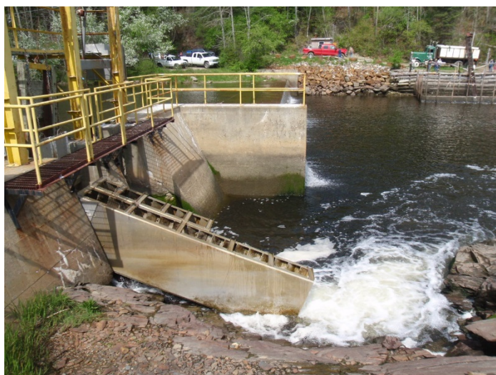
Orland Village Dam

In 2016, the latest round of feasibility study for the Orland Village dam on the Orland River—a tributary of the lower Penobscot River—was concluded with a public informational meeting held in June. Outreach also included a World Fish Migration Day event at the site with smoked alewife food truck and guided tours to the river, dam and commercial alewife harvesting area. Maine Sea Grant