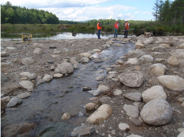
South Branch Lake Fishway

September 2016 marked the completion of two landmark fish passage projects in the Penobscot River Habitat Focus Area, at South Branch Lake and East Branch Lake. Both projects are on land owned by the Penobscot Indian Nation and included decrepit legacy dams at lake outlets that harked back to the Penobscot River watershed's history of log-driving and lumber mills. The dams were removed and