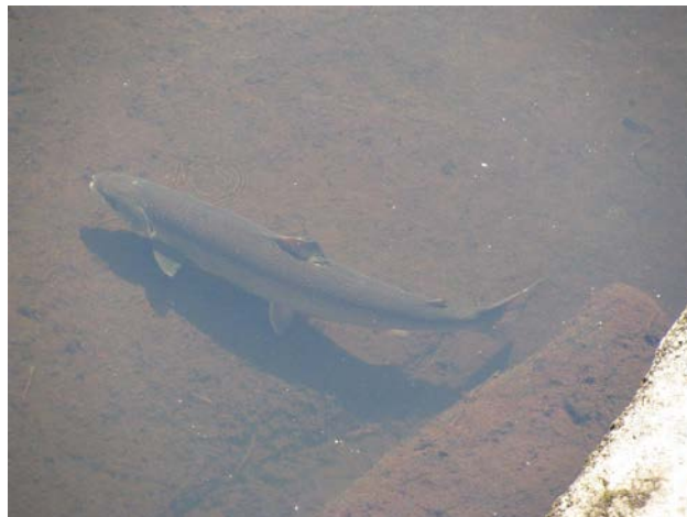
Atlantic Salmon below Frankfort Dam on Marsh Stream

The Frankfort dam sits at the head of tide on Marsh Stream, a tributary of the lower Penobscot River that once was home to numerous sea-run species including Atlantic salmon and river herring. With funding through the NOAA Habitat Blueprint, in 2016 The Nature Conservancy (TNC) continued working with the owner of dam (Town of Frankfort, Maine) on a feasibility study to examine options for improving fish passage at the site, including partial removals of the dam and different types of fishways, including nature-like bypasses and fish ladders. NOAA's interest in Marsh Stream dates back to 2010 when it provided funding for the removal of the West Winterport dam upstream. The study included reviews of documentation used to successfully list the dam on the National Register of Historic Places and addressed the dam's present-day use in providing water for firefighting in a town with scarce freshwater resources. As part of the feasibility study, the engineering firm Wright-Pierce presented at public meetings to the town's selectmen and dam committee, with hopes that consensus about fish passage improvements at the site can be found in 2017.